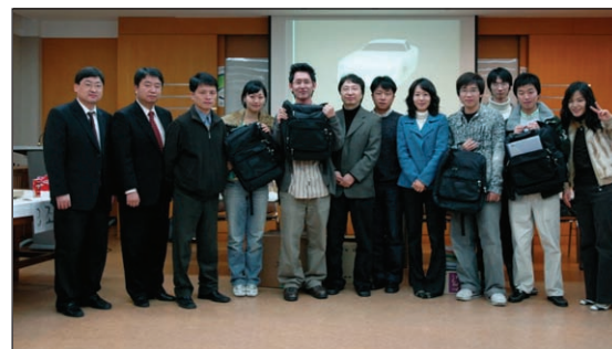
Winning team with judges and prizes