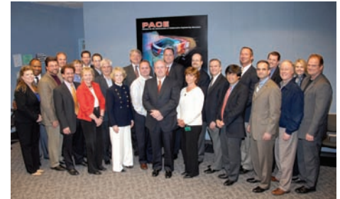
PACE Executive Sponsor Council welcomes new PACE Contributors